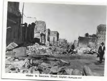
Scene in Emerson Street, Napier (Napier, 1931)