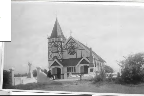
Maori Church, Graveyard Ohinemutu Village, Rotorua