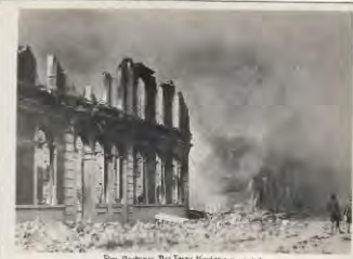
Fire Destroys the South, Napier, N.Z.