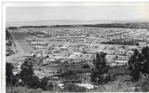
Overlooking Napier from N.Z. 7500.

Mexican Waterlily at Auckland, leaf measures 6 ft 3" across holds 200 lb weight. Went to Levin Show on Sat. 29 th . Very good parade. Leave for Napier on 4 th Feb. Very good time at Napier returned on 7 th went for drive to the port around Hastings back through the Cemetery and saw the reclaimed land, then another trip to the Gavie Reserve where the Salmon trout are hatched, also Piasauts and the Kiwi. On to Le-Matra peak once 2000 feet above sea level and got a lovely view of Napier and the harbour. Went to the Skating Carnival Saturday night, Marine Parade all illuminated, a lovely night, returned home Sunday afternoon.