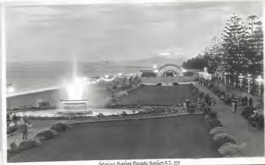
Evening Marine Parade, Napier, N.Z. 275