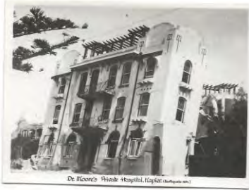
De Moore's House Napier (Napier, 1931)