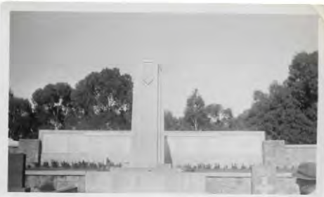
GRAVE OF EARTHQUAKE VICTIMS NAPIER CEMETERY