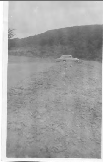
Graves of unknown victims of NZ Railway Disaster