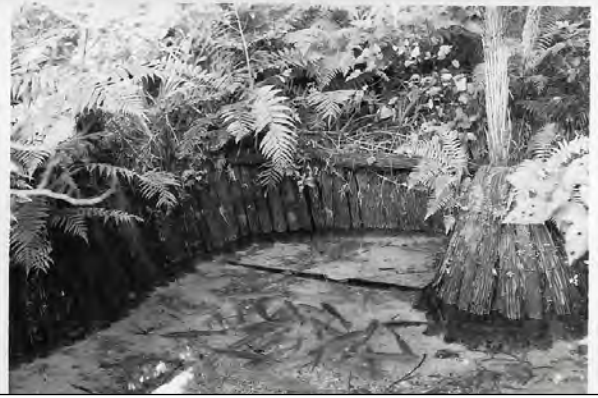
RAINBOW TROUT, HAMURANA SPRINGS