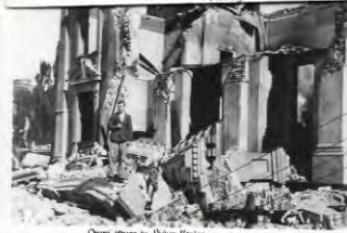
Open House in Napier, Napier, N.Z.