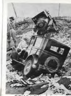
Skullered Napier, Whakapu Road.