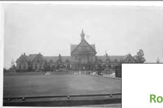
Bath House Rotorua Gardens