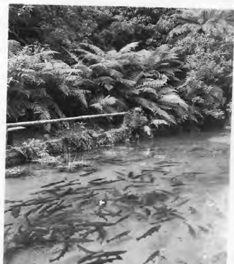
RAINBOW TROUT, TANIWHA SPRINGS