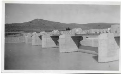
NEW DAM AT LAKE PUKAKI