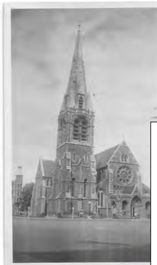
CHRISTCHURCH CATHEDRAL & CATHEDRAL SQUARE