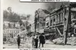
Fire Starts in Hastings Street, Napier, N.Z.