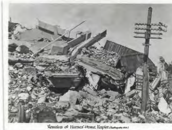
Remains of Moore's House, Napier (Napier, 1931)