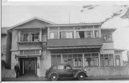
OCEAN VIEW MARINE PARADE NAPIER