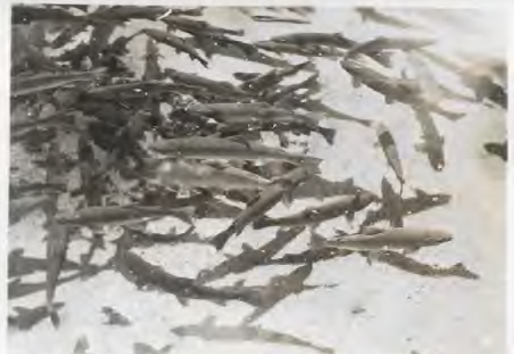
RAINBOW TROUT, HAMURANA SPRINGS