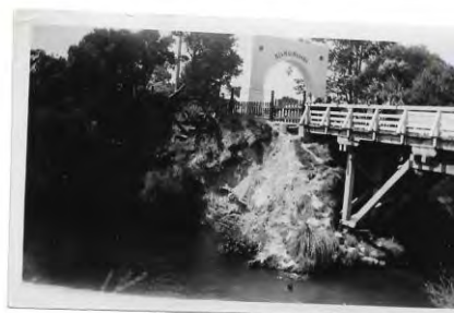
12/1/54 Swimming Pool Whako