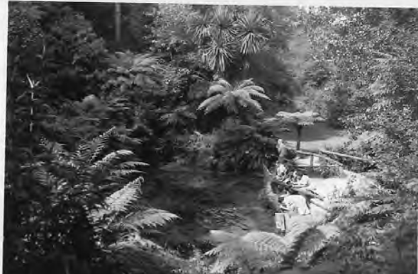
TROUT POOL, TANIWHA SPRINGS