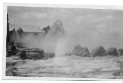
12/1/54 Boiling Pool Whako