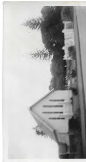
Left: Alter Cloth at Maori Church, Otaki NZ presented by Queen Elizabeth II