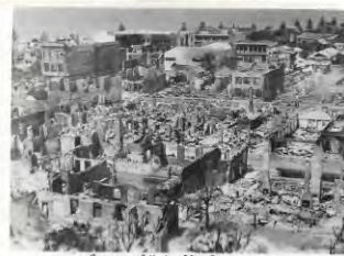
Panorama of Napier After Fire.