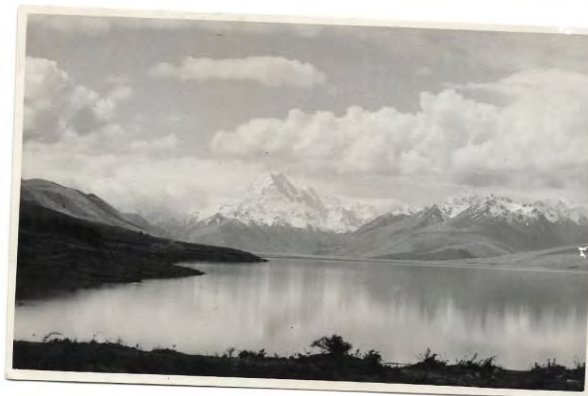
MOUNT COOK AND LAKE PUKAKI (ON BACK OF NZ 5P NOTE)