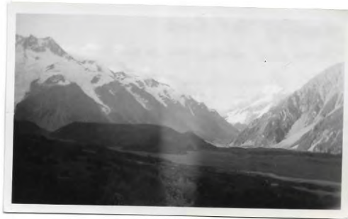
VIEW OF MT COOK FROM OUR BEDROOM WINDOW AT THE HERMITAGE NZ