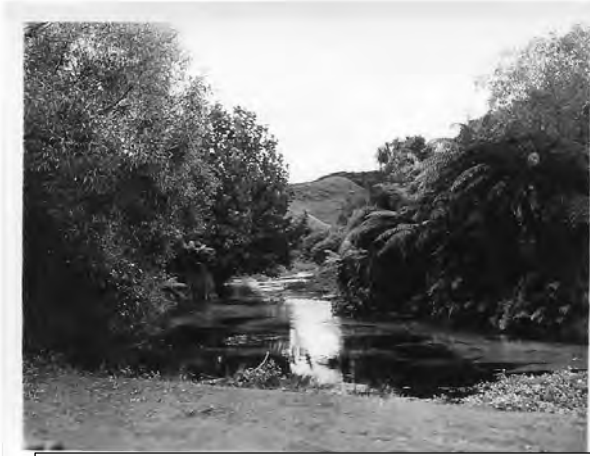
WATERFALL POOL - HASNEY THE FREAK FISH